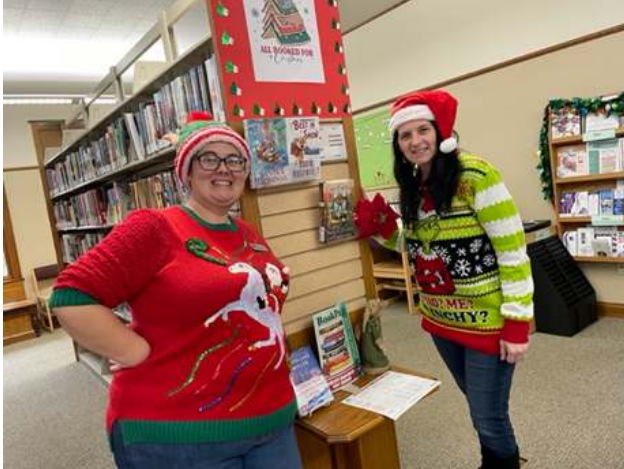
Ugly Sweater Day